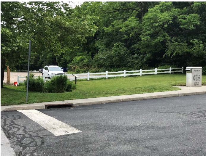
Figure 5 – View of site and CSHSP parking lot.