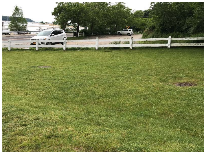
Figure 7 – View from sidewalk along Library driveway.