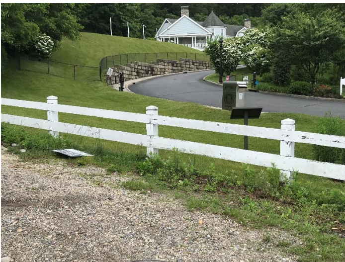
Figure 7 – View of slope towards the Library from parking lot.