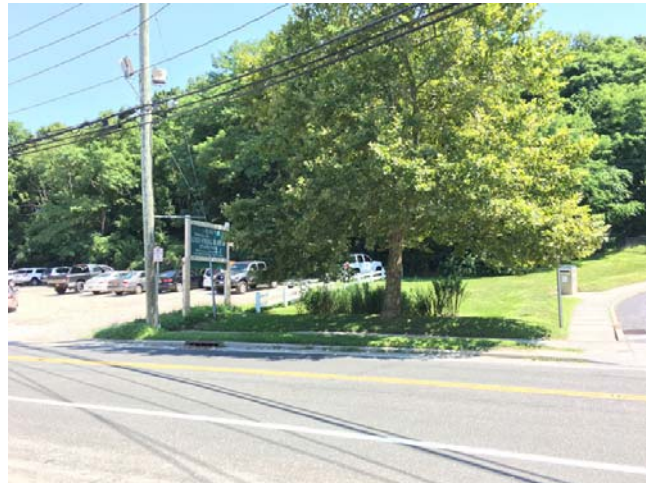
View of monument site from street.

The artist and their sub-contractors (herein known as “Bidder”) will be responsible for conducting site research as needed and is expected to provide a conceptual site design plan which will be developed and implemented by the OPRHP Long Island Regional staff. Site Plan and additional site photos may be found in Exhibit 1.