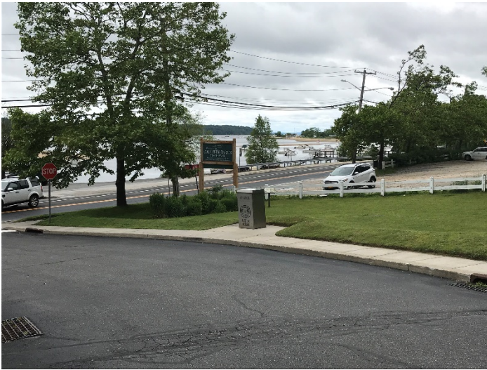
Figure 3 – View towards Cold Spring Harbor.