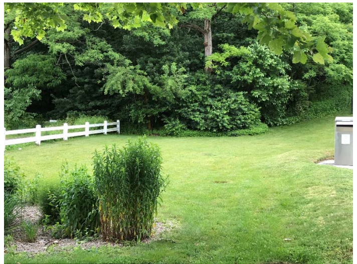
Figure 6 – View of proposed monument location from sidewalk.