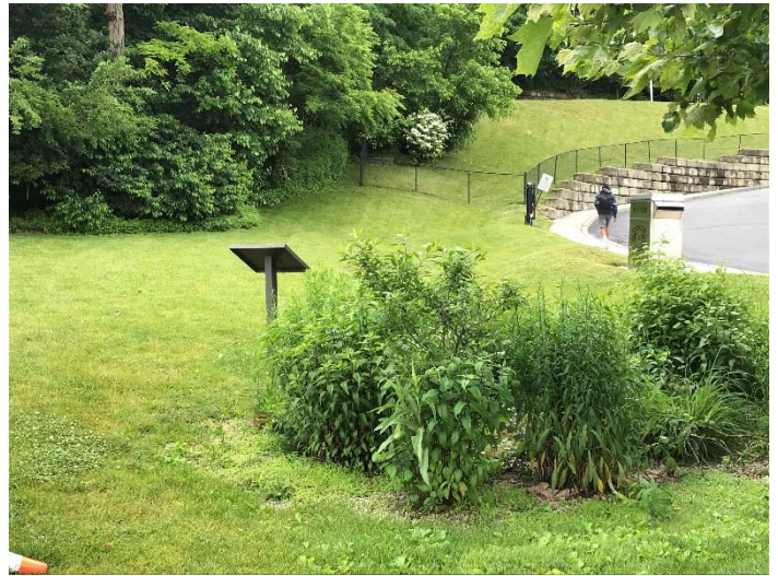
Figure 4 – View of rain garden.